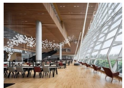
Shanghai Library East (2023)