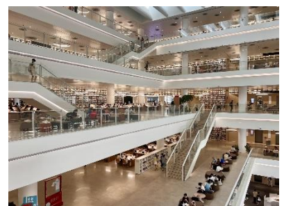
Shenzhen Library North (2024)