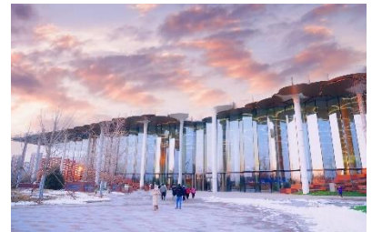
Beijing Library (2024) Winner

Winner and finalist of IFLA Public Library of the Year from China